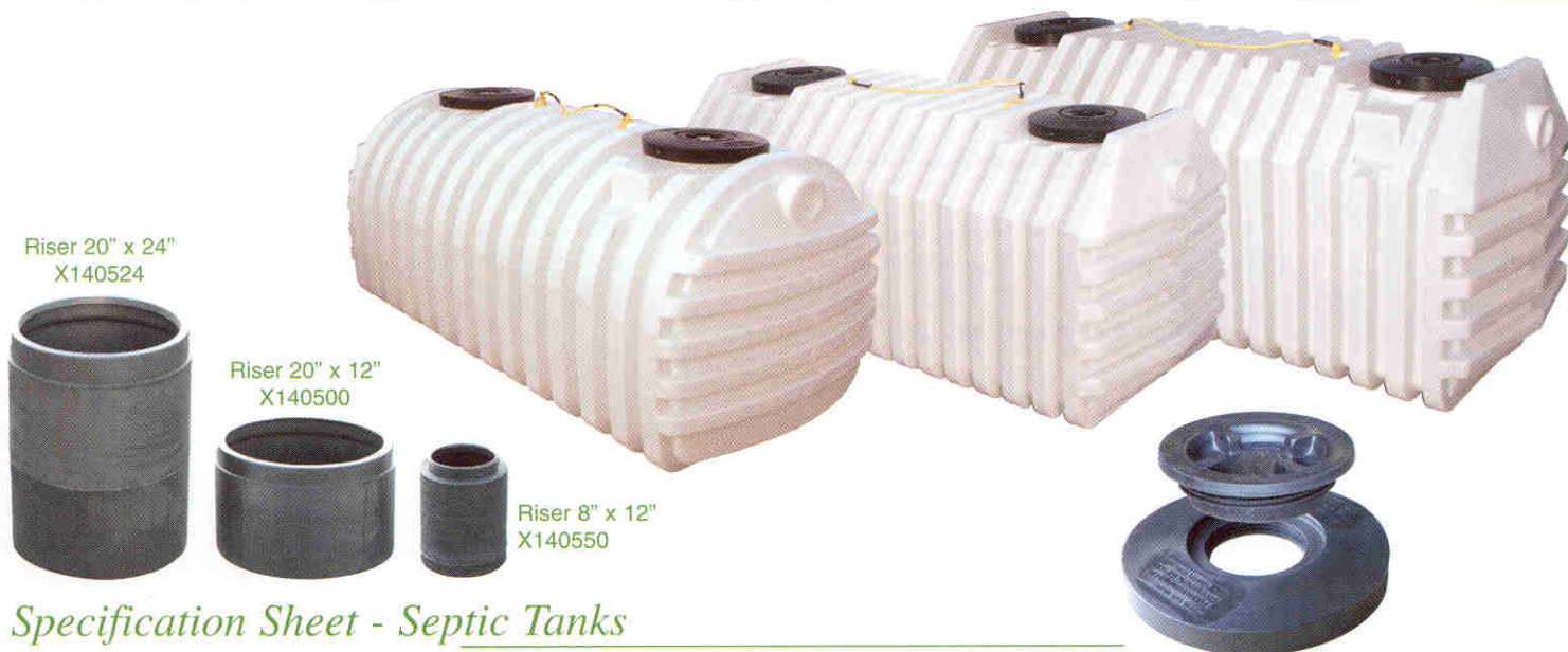
Riser 20" x 24" X140524