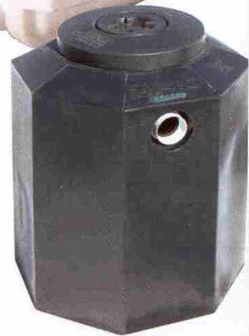
Pumping Chamber X140475